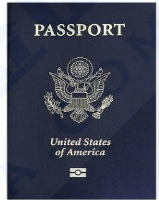
4. Original US Passport With at least 6 months validity (Required)