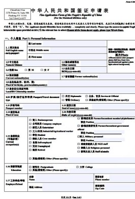
2. Original Visa Application (Required)