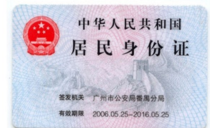
8. Copy of Inviter's proof of residency (front and back)

For your convenience, you can check off documents that you will need while speaking with our customer service.