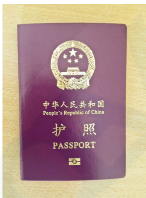
5. China Passport 如果是第一次办理中国签证 必须提供原中国护照原件！