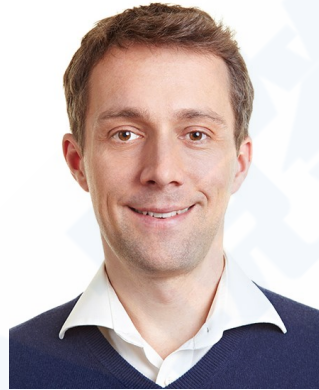
3. One Passport Photo (Required)