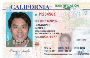
6. Copy of Photo ID i.e., Driver License, State ID