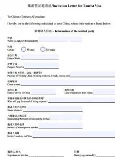
7. Copy of Invitation Letter. Handwritten is recommended